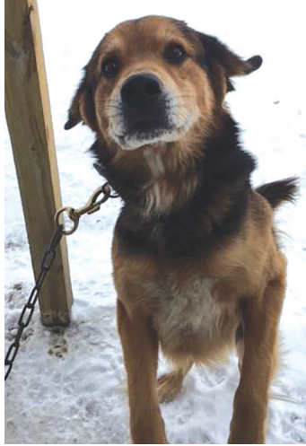
Gordy & Friends gives pet owners options beyond leaving pets chained outside.

We work right on the spot to improve the life of the dog.